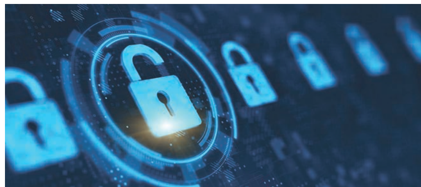
The firewall is offered as a managed or co-managed service running as a VNF. This allows Windstream to eliminate the need for additional security appliances at the branch