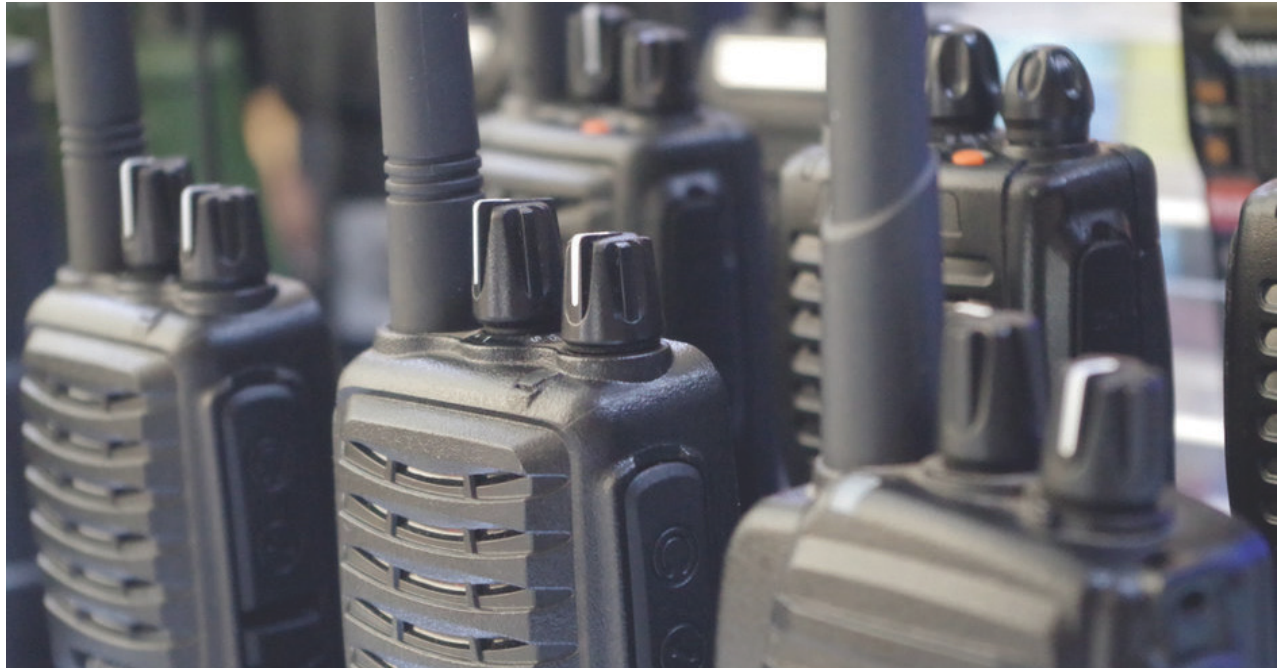
So, if the network is safe and it can be deployed in pretty much any situation, is there a question mark surrounding the technology itself?