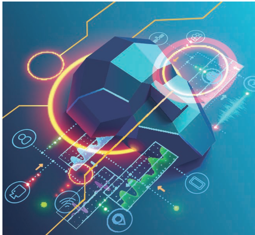
The Artificial Intelligence in Europe Survey, conducted by Interxion, showed that enterprise roadmaps for AI deployment over the next two years are already quite concrete

The survey further revealed that infrastructure requirements for implementing AI vary from one industry to another. However, it is clear that for all enterprises, optimising infrastructure