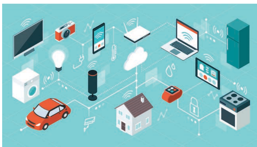
By transforming the environment with billions of active devices, IoT will enable countless possibilities from autonomous vehicles to wearable technology, connected health and smarter cities

Sealing the future of IoT, is oneM2M's latest set of specifications, Release 4, which will continue to create a common language between IoT devices, enabling vertical interoperability, best-in-class security and interworking with legacy IoT standards.